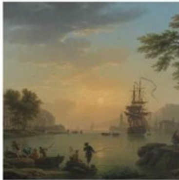
A Landscape at Sunset