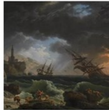
A Shipwreck in Stormy Seas